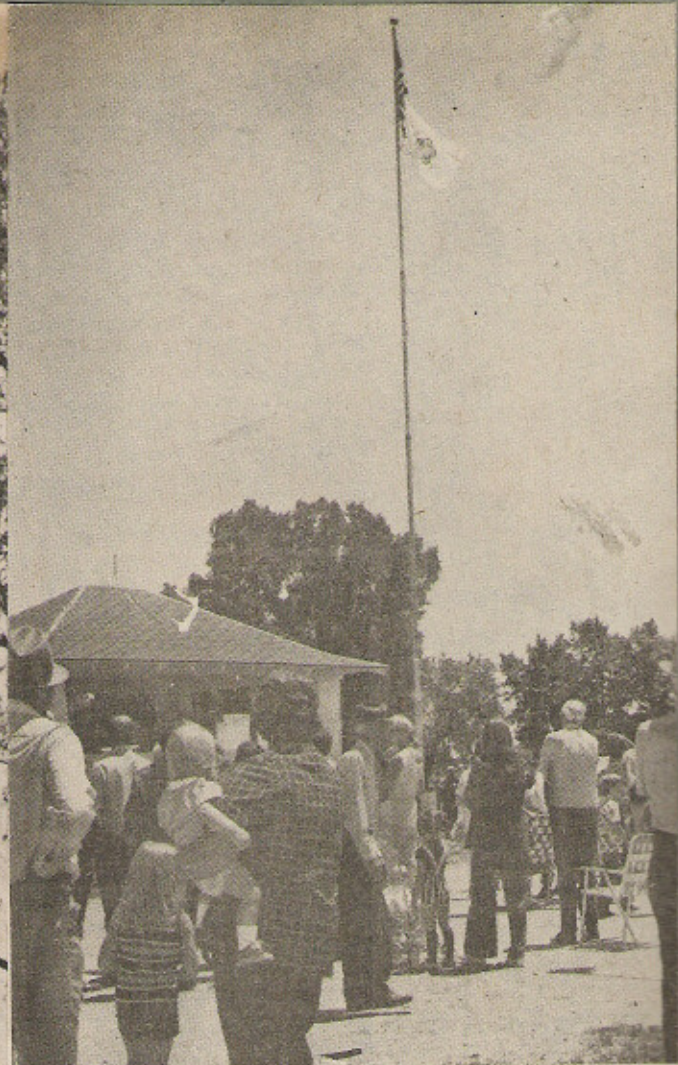
THE BICENTENNIAL FLAG flies over Hordville during town's celebration Saturday. A large crowd attended the two festivities that were climaxed by a Sunday picnic.