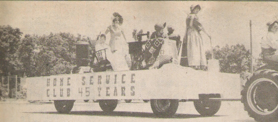
HOME SERVICE CLUB , one of the area's oldest displayed some of the Bicentennial dress of the early days as they passed down the street during the Hordville parade.