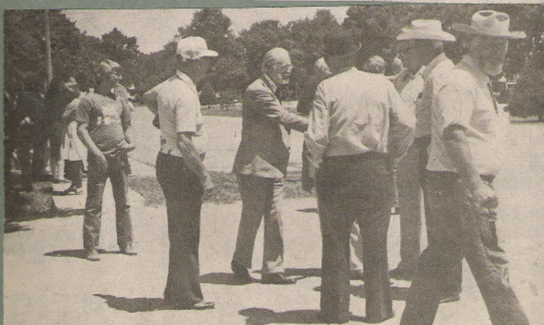
HORDVILLE BICENTENNIAL DAYS was a chance for renewing acquaintances and a day for visiting prior to the parade.