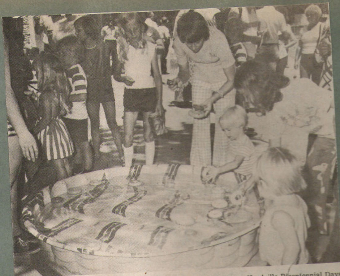
BOBBIN' FOR RINGS brought delight to many youngsters during Hordville Bicentennial Days. The display was just one of many concession stands at the event.