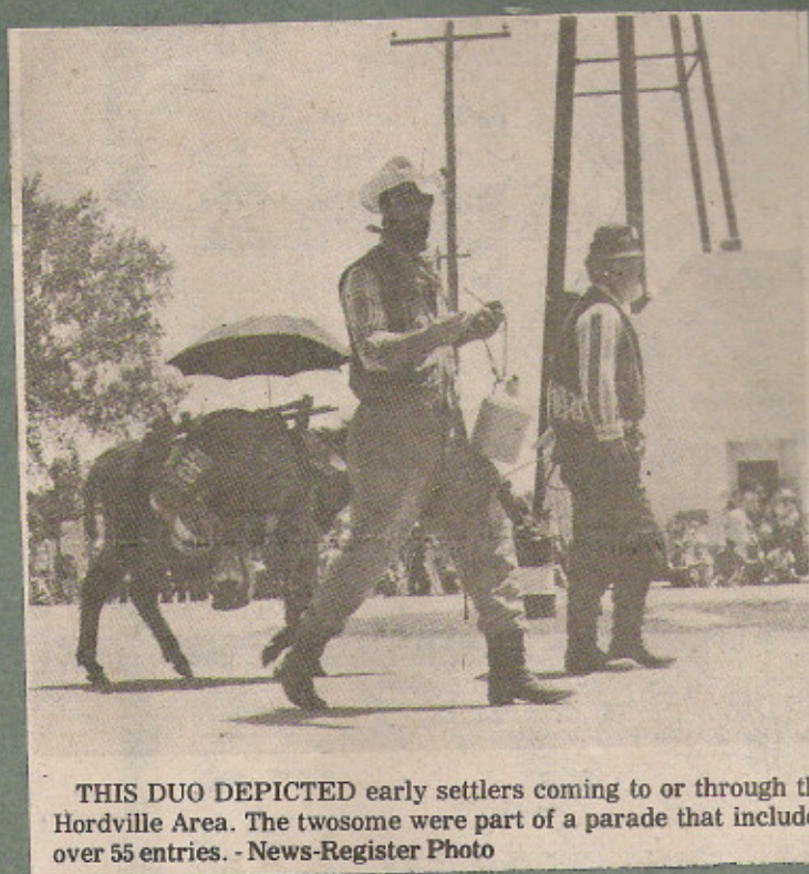
THIS DUO DEPICTED early settlers coming to or through the Hordville Area. The twosome were part of a parade that included over 55 entries. - News-Register Photo