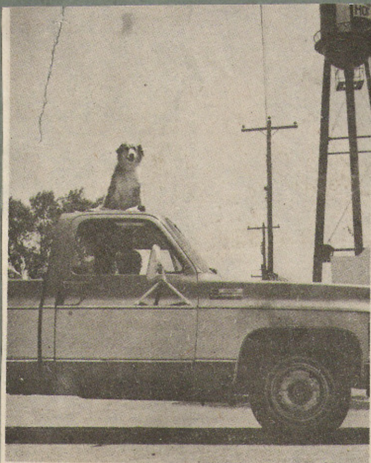
FINDING A FAVORITE spot to ride was this pooch during the Hordville Bicentennial parade. The dog maintained his position throughout the entire parade route.