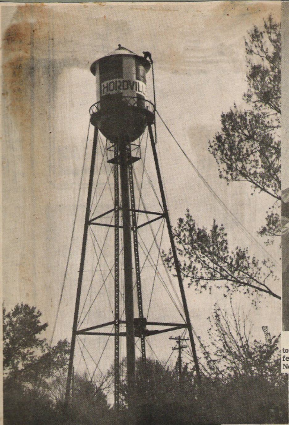
THE BICENTENNIAL COLORS go on the Hordville water tower as part of the community wide project for their Bicentennial Days scheduled for June. Hordville is one of several Hamilton County communities setting events for the Nation's 200th birthday.